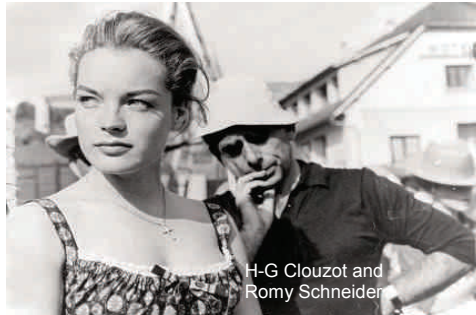
H-G Clouzot and Romy Schneider